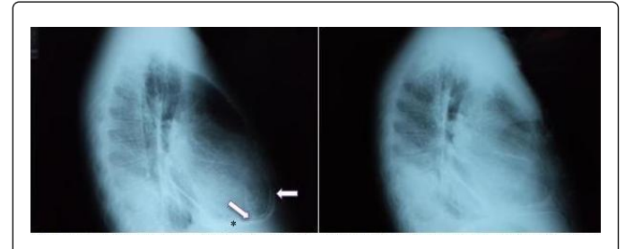
Figure 1: Chest x-ray. Lateral view showed calcified mass along diaphragmatic surface of the heart(*) and pericardial calcification (arrows). A. before stripping, B. after stripping

beats per minute. Chest X ray showed a thickened and calcified pericardium (Figure 1). Trans-thoracic echocardiography demonstrated pericardial thickening, preserved biventricular ejection fraction with decreased end diastolic and end systolic volumes. Additionally, there was significant dilation of the SVC, IVC, and hepatic veins. Cardiac catheterization was performed one week post admission after the patient received intravenous diuretics, which was non-responsive to fluid balance. Superior vena cava pressure was 23 mmHg, right atrium pressure was 25 mmHg, right ventricle end diastolic pressure was 27 mmHg and left ventricle end diastolic pressure was 30 mmHg. Simultaneous pressure measurements of the right ventricle and left ventricle revealed an early diastolic 'dip and plateau' and equalization of end diastolic pressures. Plasma tests were negative for antinuclear antibodies, anticardiolipins, and rheumatoid factor, complement (C3, C4) levels were normal. Chest x-ray, echocardiography and catheterization demonstrated findings consistent with recurrent pericardial constriction.