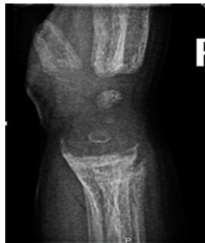
Figure 2: Radiological changes including cupping, fraying, widening of metaphysis, and osteopenia before treatment

All patients showed low normal calcium with low phosphorous levels and high alkaline phosphatase levels The levels of 1,25(\text{OH})_2\text{D} are elevated which is considered to be the diagnostic hallmark of this disease [2]. HVDRR is resistant to vitamin D treatment and the response to massive doses of 1,25 -dihydroxyvitamin D is variable.