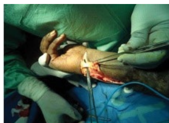
Figure 10: Flexor carpi ulnaris to extensor carpi radialis brevis.