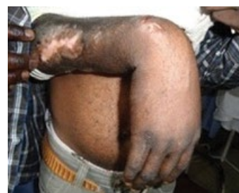
Figure 2: Radial nerve palsy (before surgery).