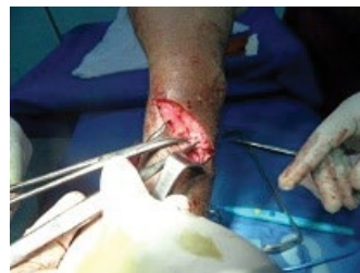
Figure 12: Transfer of flexor carpi ulnaris to extensor digitorum communis.