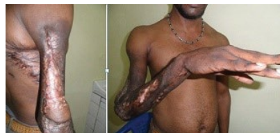
Figure 15: Result after surgery with follow-up of three years: excellent flexion and extension of elbow, wrist, fingers and thumb.

pronator teres to extensor carpi radialis brevis . But they differ for the restoration of the extension of the fingers and thumb [11].