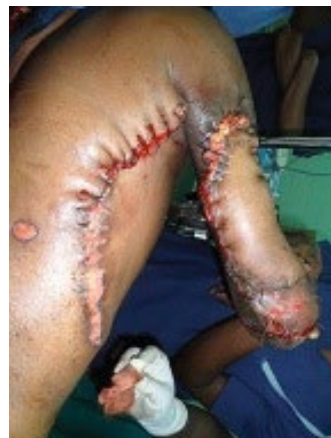
Figure 6: Weaning flap (3 weeks after).