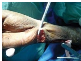
Figure 13: Palmaris longus to extensor pollicis longus.