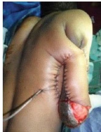
Figure 5: Latissimus dorsi flap in arm.