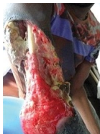
Figure 1: Large BU of arm (before surgery).

The place of contamination would be the new focus of BU that was recently discovered along the Cuango / Kwango River between the Republic of Angola and the DRC [7]. The initial form of the disease was a nodule that had evolved into a large ulcer. Despite a prescribed and taken by the patient in Angola chemotherapy, the disease worsened, pattern transfer in the DRC for better management Upon arrival in our Unit of Plastic Surgery of University Hospital of