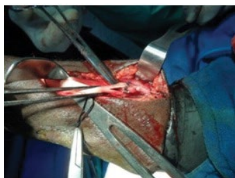
Figure 9: Transfer of pronator teres.

The flap of latissimus dorsi is universal flap in plastic surgery and it opens up many possibilities for repair as illustrated by this very complex case sequelae of BU [9]. As for the treatment of radial nerve palsy, we opted for a triple tendon transfer according to Merle d'Aubigné technical [10], with fireworks Tubiana [11]. This technique is simple and reliable implementation, easily reproducible. If radial palsy, paralysis of wrist extension alone lost two thirds of the normal gripping force of the hand. The best engine to use pronator teres is the priority. Several therapeutic options is considered. Indeed, Tubiana, Smith and Boyes to restore wrist extension, they transfer all