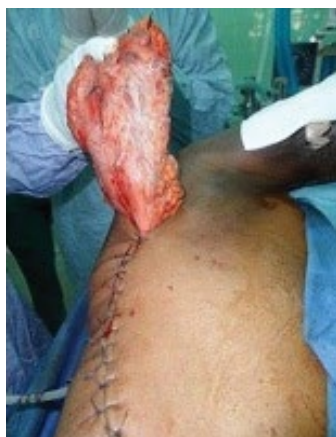
Figure 4: Latissimus dorsi flap.