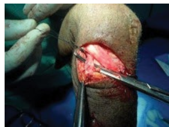
Figure 14: Transfer of Palmaris longus.