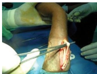
Figure 8: Extensor carpi radialis brevis.