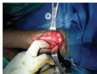
Figure 7: Pronatorteres.