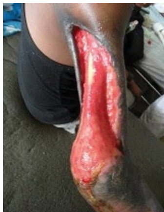
Figure 3: Large BU (after cleaning).

Immobilization for three weeks followed by rehabilitation was performed after surgery. The patient recovered the different functions of member repaired. After follow-up of three years, no complications