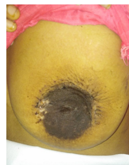
Figure 2: POD 7 Wound.

She was on regular follow up on POD 7 her wound looked healthy and healing, suture removal was done on POD 7 (Figure 2).